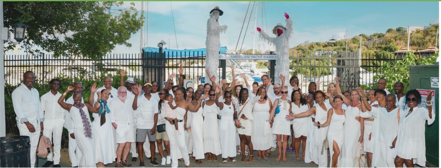
COMMUNITY VIBES: Attendees enjoy a joyous moment before boarding the elegant Lady Lynsey Catamaran for the Healing Hands Worldwide, Inc. Fundraising Sunset Sail at American Yacht Harbor on St. Thomas earlier this year.